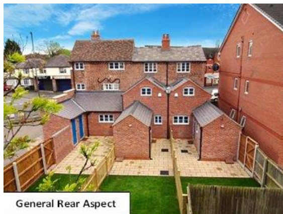
General Rear Aspect