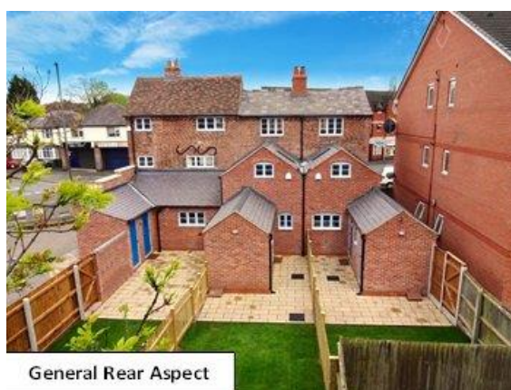
General Rear Aspect